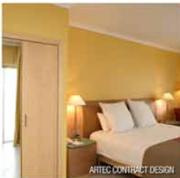
ARTEC CONTRACT DESIGN