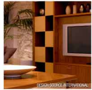
DESIGN SOURCE INTERNATIONAL

S.A.W. Ltd. is an innovative, client-driven, service-oriented company that takes pride in aiding customers on projects of any size.