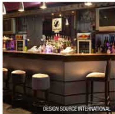
DESIGN SOURCE INTERNATIONAL