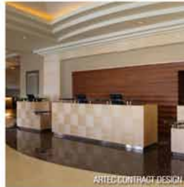
ARTEC CONTRACT DESIGN