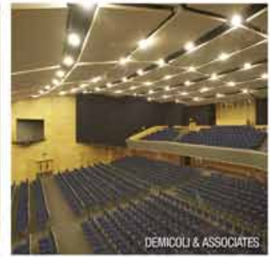
DEMICOLO & ASSOCIATES