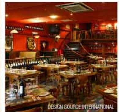
DESIGN SOURCE INTERNATIONAL